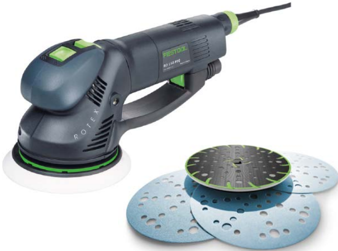
Festool eccentric sander ROTEX RO 150 FEQ-Plus and patented MULTI-JETSTREAM 2 (or equivalent)

WITH MULTI-JETSTREAM 2 AND FESTOOL DUST EXTRACTOR CTL 36 E AC HD