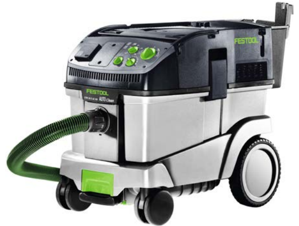
Festool dust extractor CTL 36 E AC HD with SC FIS-CT 36/5 SELFCLEAN filter bag 3.5 m Ø 27-32 mm hose (or equivalent)