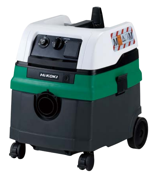
HiKOKI vacuum cleaner RP250YDM with 5 m Ø 35 mm suction hose (or equivalent)

HiKOKI rotary hammer DH18DPA with telescopic dust extraction adapter (or equivalent)