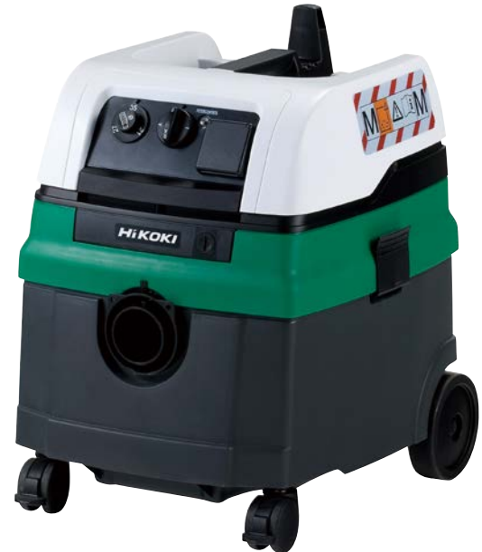
HiKOKI vacuum cleaner RP250YDM with 5 m Ø 35 mm suction hose and polyester dust bag (or equivalent)