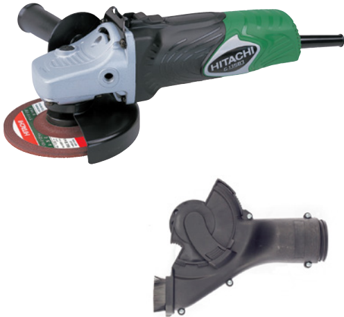
Hitachi angle grinder G13SB3 with Dusttool collection unit (or equivalent)

IN COMBINATION WITH DUSTTOOL COLLECTION UNIT AND HITACHI VACUUM CLEANER RNT 1225 M