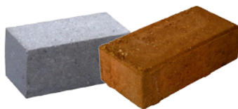
concrete / brick