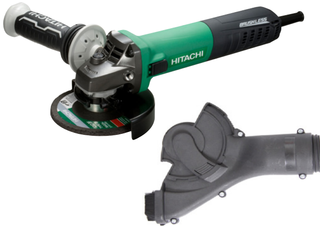
Hitachi angle grinder G13SVE with Dusttool dust hood (or equivalent)

IN COMBINATION WITH DUSTTOOL DUST HOOD AND HITACHI DUST EXTRACTOR RNT 1225 M