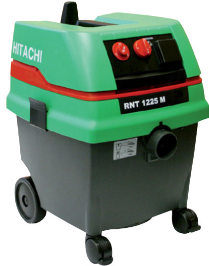
Hitachi dust extractor RNT 1225 M with 3.5 m Ø 38 mm suction hose (or equivalent)