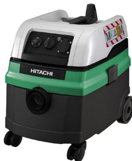
Hitachi vacuum cleaner RP250YDM(WA) with 5 m Ø 35 mm hose and plastic dustbag (or equivalent)