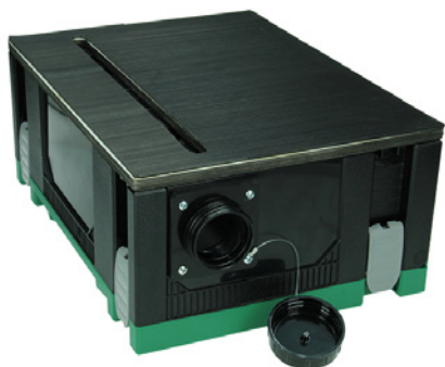
Hitachi (extraction) saw table

IN COMBINATION WITH HITACHI VACUUM CLEANER RP250YDM(WA)