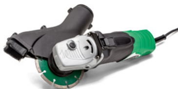
Hitachi angle grinder with Dustco collection unit