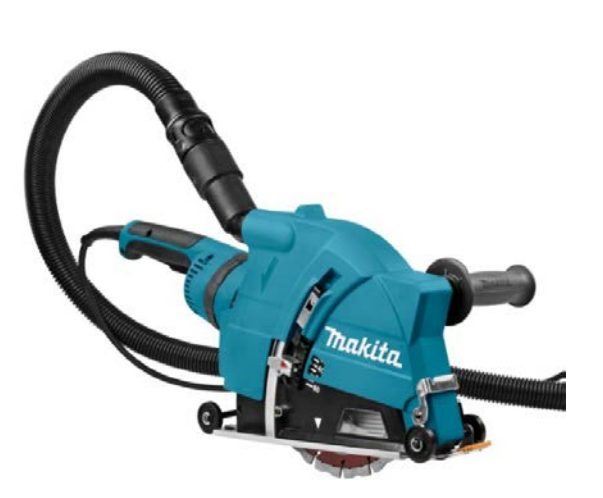
Makita concrete angle grinder GA9040RF01 with dusthood 198440-5 (or equivalent)