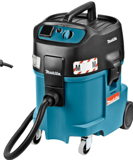
Makita vacuum cleaner 447M with 3 meter Ø 36 mm hose (or equivalent) Recommended use: with dust bag