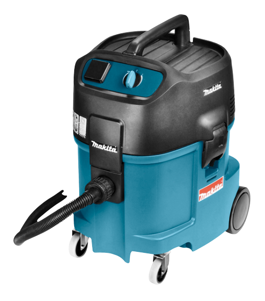
Makita vacuum cleaner 447L with 3,5 meter Ø 38 mm hose (or equivalent)