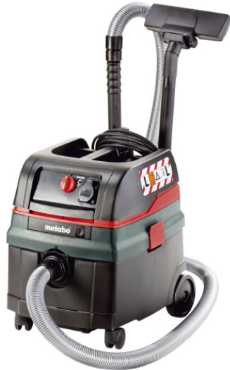
Metabo vacuum cleaner ASR 25 L SC with 3 m Ø 50 mm hose (or equivalent)

IN COMBINATION WITH 125 MM ANGLE GRINDER WITH DUSTTOOL EXTRACTION HOOD