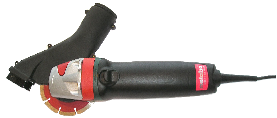
125 mm angle grinder (WE 9-125 Quick) with Dusttool extraction hood