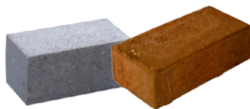
concrete / brick