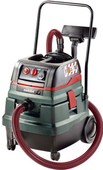
Metabo vacuum cleaner ASR 50 M SC with 3 m Ø 50 mm hose (or equivalent)

IN COMBINATION WITH 125 MM ANGLE GRINDER WITH DUSTTOOL EXTRACTION HOOD