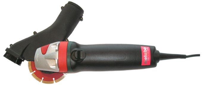
125 mm angle grinder (WE 9-125 Quick) with Dusttool extraction hood

metabo PROFESSIONAL POWER TOOL SOLUTIONS