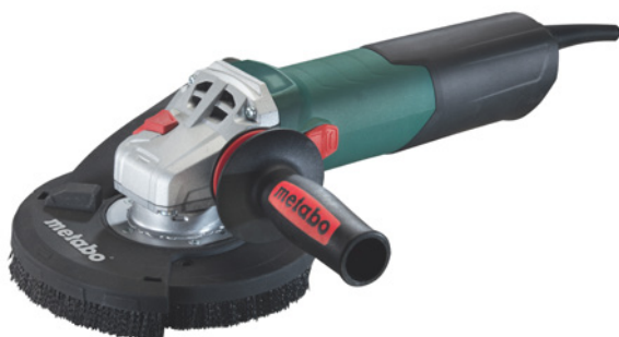
Metabo angle grinder W 15-125 HD with Metabo guard (or equivalent)

IN COMBINATION WITH METABO GUARD WITH VACUUM CLEANER ASR 50 M SC