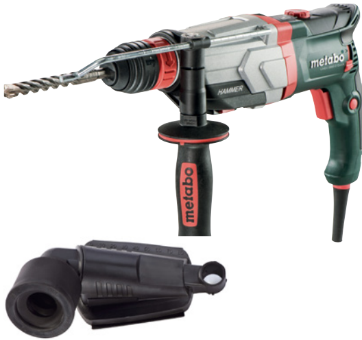
Metabo multi hammer UHEV 2860-2 Quick with dust extraction adapter 630829000

WITH DUST EXTRACTION ADAPTER 630829000 AND VACUUM CLEANER ASR 50 M SC