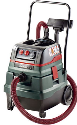
Metabo vacuum cleaner ASR 50 M SC with 5.0 m Ø 26 mm hose (or equivalent)