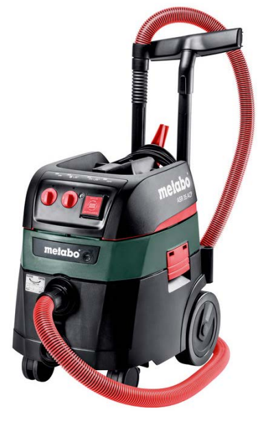
Metabo vacuum cleaner ASR 35 M ACP