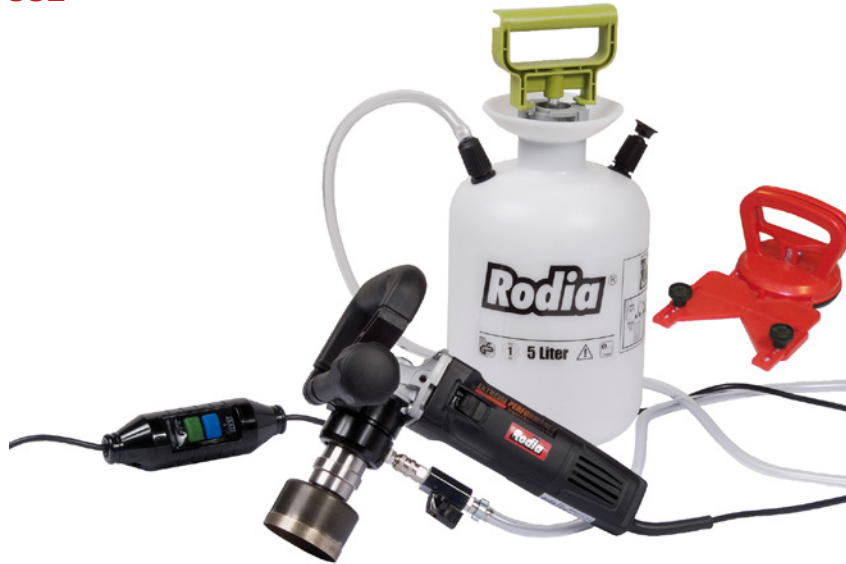
Rodia / Diamond 3 FB750W Angular Tile Drill (or equivalent)