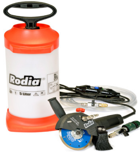
Rodia / Diamond 3 WGK125 Wet Grinding Kit (or equivalent)