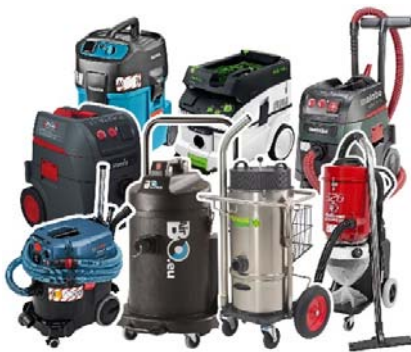
Different vacuum cleaners