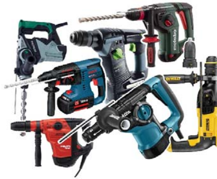
Different drill hammers (or angle grinders)