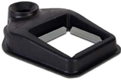
Rubi dust extraction ZERO DUST GUIDE