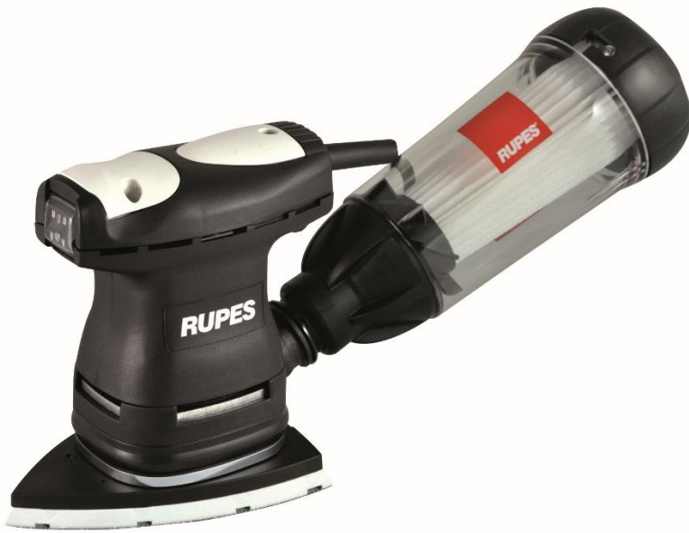
Figure 1. Rupes LE7TE with add-on filter Greentech.

Table 1 lists the key technical specifications of the system tested and its equivalents.